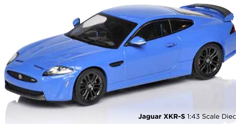
Jaguar XKR-S 1:43 Scale Diecast Model