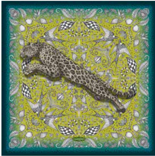
Chartreuse - Part Number: JSTSILKCH