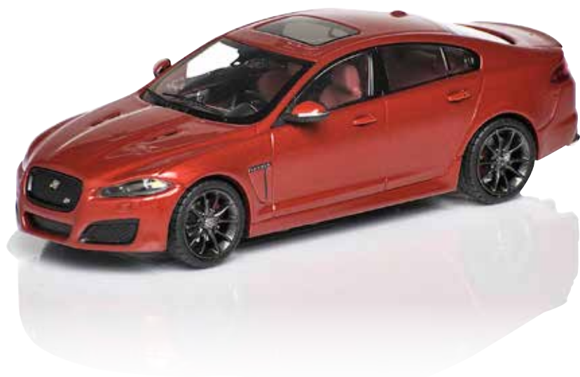
Jaguar XFR 1:43 Scale Diecast Model