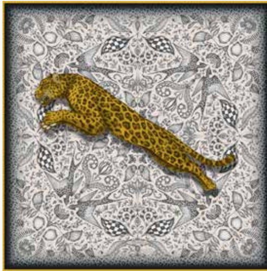
Nude Gold - Part Number: JSTSILKNG