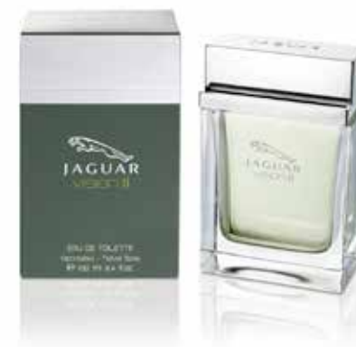
JAGUAR VISION II

Top notes aromas of grapefruit, mandarin and pink pepper are complemented by base notes of refined amber, vanilla and tonka beans.