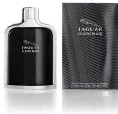
JAGUAR CLASSIC BLACK

Sparkling citrus and pink pepper top notes combine with amber and cedarwood basenotes in this sophisticated aroma.