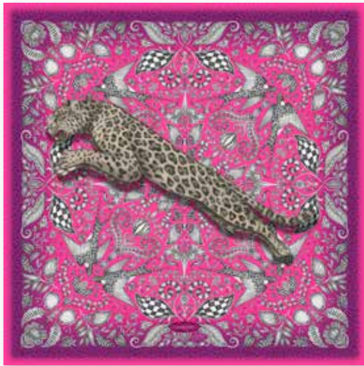
Claret- Part Number: JSTSILKCL