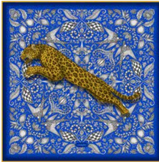
Cobalt - Part Number: JSTSILKCOB