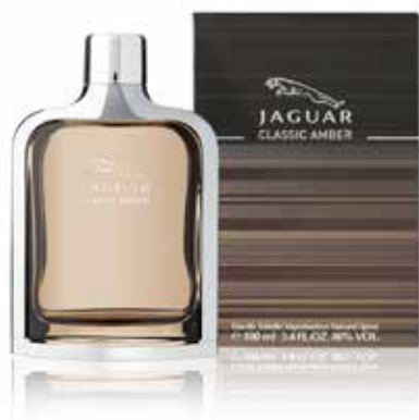
JAGUAR CLASSIC AMBER

Introducing a selection of the most popular fragrances from Jaguar Fragrance. This range of fragrances have been especially chosen for their blend of scents appealing to the modern consumer.